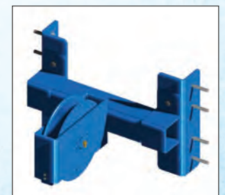
Side Wall Mount Wheel

Efficient, Simple to Operate, Easy to Maintain!