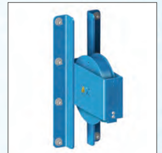
End Wall Mount Wheel